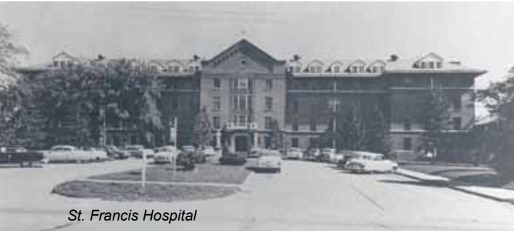
St. Francis Hospital

This year the very heart of our foundation, the Wheaton Franciscan Sisters, celebrated 150 years of dedication. The Sisters brought their healing ministry to the Cedar Valley 100 years ago when the citizens of Waterloo requested their help to establish a hospital. The citizens agreed to raise money for the hospital, the land was donated and finally, in 1911 the cornerstone was laid for St. Francis Hospital on Independence Avenue in Waterloo.