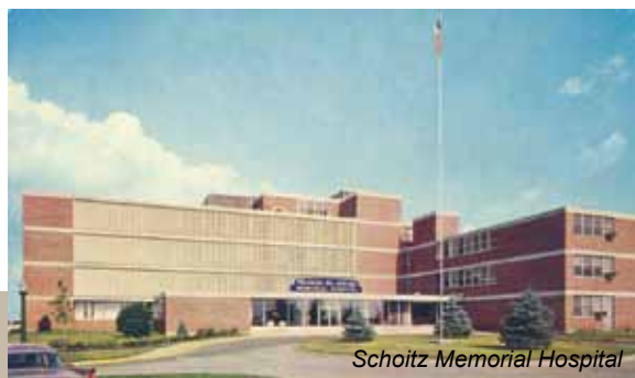
Schoitz Memorial Hospital