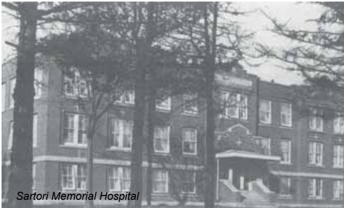
Sartori Memorial Hospital

This year the very heart of our foundation, the Wheaton Franciscan Sisters, celebrated 150 years of dedication. The Sisters brought their healing ministry to the Cedar Valley 100 years ago when the citizens of Waterloo requested their help to establish a hospital. The citizens agreed to raise money for the hospital, the land was donated and finally, in 1911 the cornerstone was laid for St. Francis Hospital on Independence Avenue in Waterloo.