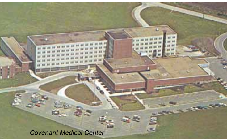
Covenant Medical Center

St. Francis Hospital earned the trust of the community through years of excellent care. As time passed, medical advances and additional demand led the Sisters to evaluate innovative partnerships to meet the needs of the time. In 1986, the Franciscan Sisters worked with Schoitz Medical Center and consolidated to form Covenant Medical Center 25 years ago in 1986.