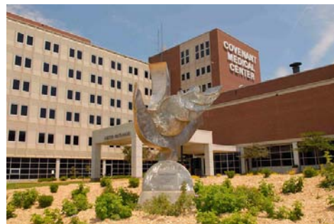
Covenant Medical Center